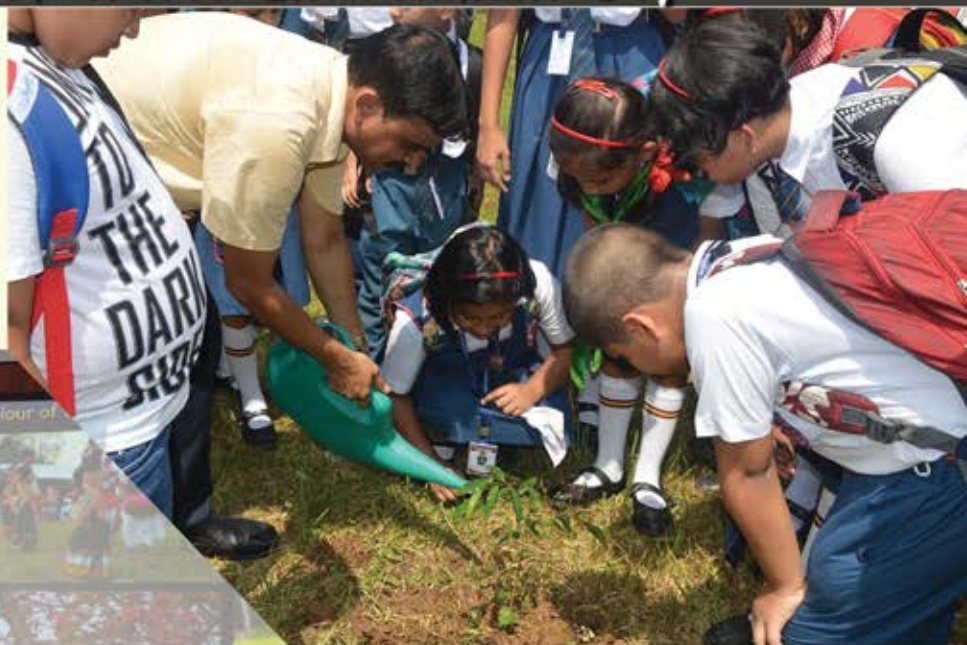
Top: Students and others taking part in Tree Plantation program in the premises of the Science Centre.