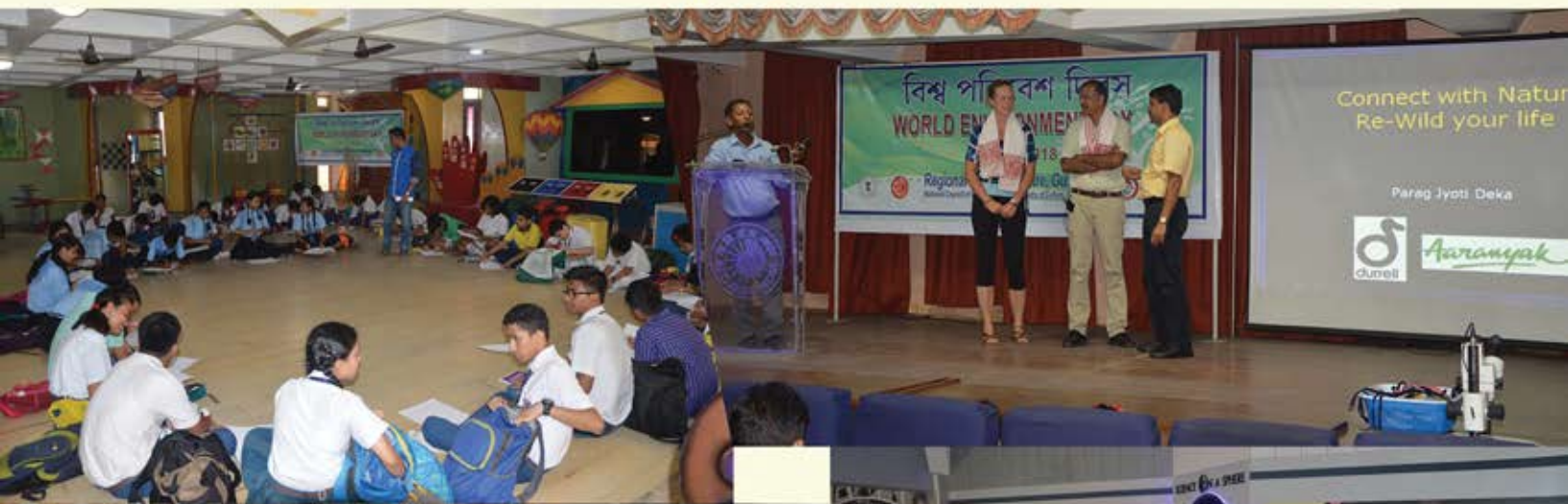
Bottom: Children taking part in Art and Environmental game. Also seen introducing the Guest before the audience